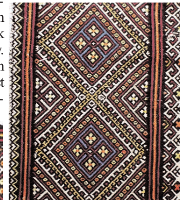
Embroidery samples from Hutsul region